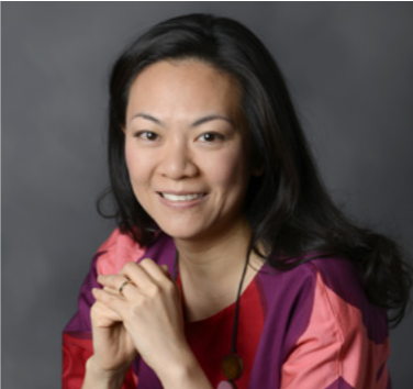
With grateful hearts for each one of you and your partnership with us,